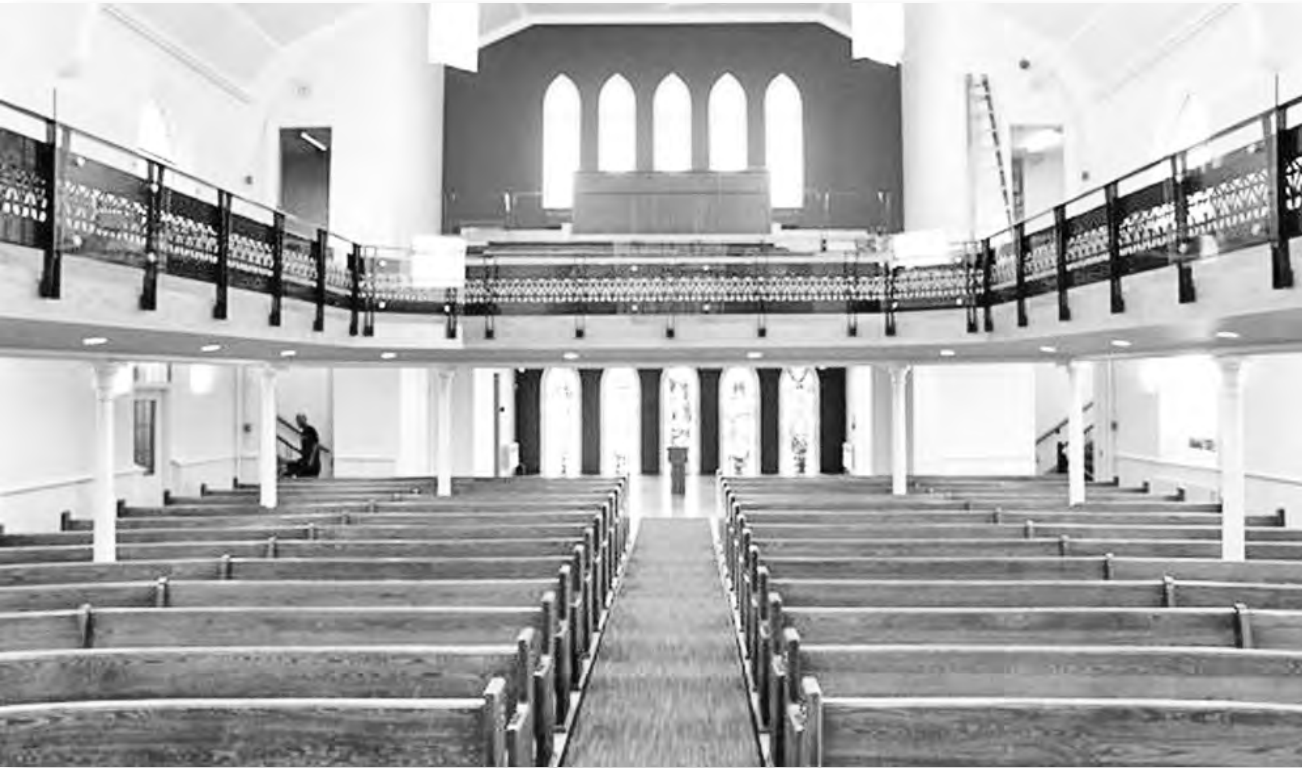
A ladder remains in the upper level of the Aurora United Church. Workers found a tree holding up one of the towers when they renovated the building.