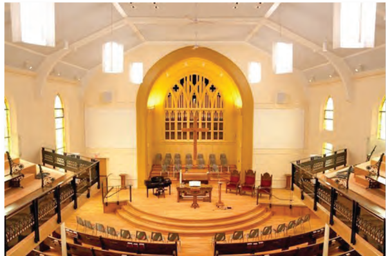
New look inside old church. Parishioners are amazed at the change inside the Aurora United Church now that renovations are complete. Another photo on Page 12.

Vol. 10 No. 2 905-727-3300 auroran.com FREE Week of October 27, 2009